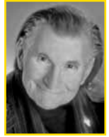
Michael C. Rann