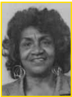
Dorothy A. Johnson